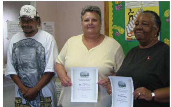
CDPM patients graduate from Diabetes Education Class.

The Chronic Disease Prevention and Management (CDPM) program is focused on the management of diabetes and heart disease, the most challenging conditions for local people. About 80% of our patients live with one or both of these conditions.