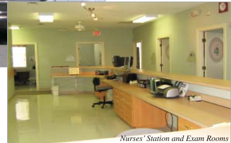
Nurses' Station and Exam Rooms

Plans to add free dental and vision care, similar to those provided in Brunswick are underway.