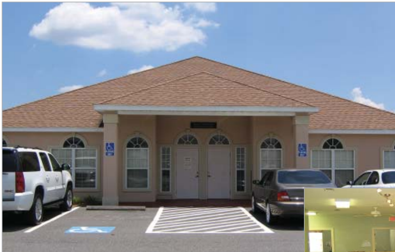
Henri C. Woodman Community Clinic Kingsland